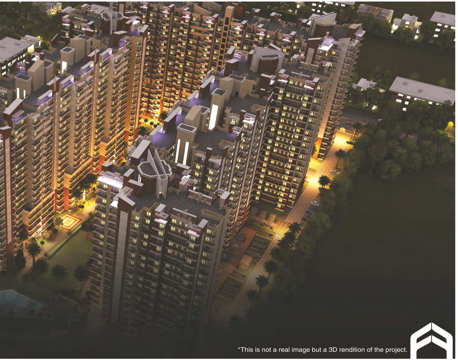
*This is not a real image but a 3D rendition of the project.